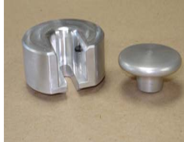
Figure # 1