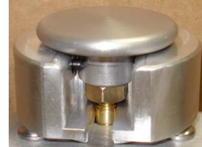
Figure # 3