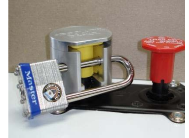
Figure # 4