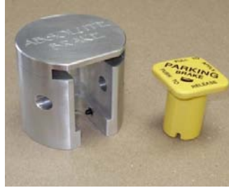
Figure # 1