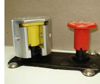
Figure # 3